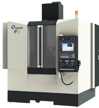
F5- Vertical Machining Centre