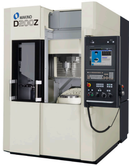
D200Z- Vertical 5-axis Machining Centre