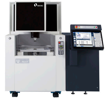
U6- H.E.A.T. Wire EDM